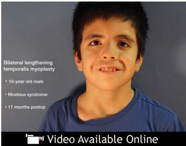
Video 2. Supplemental Digital Content 2 demonstrates postoperative perioral function following a bilateral lengthening temporalis myoplasty procedure for the patient in case 2 (patient 12 in Table 1). http://links.lww.com/PRS/B656 .

sutures in the perioral region required for recreation of the nasolabial fold.